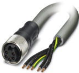
Power cable, 5-pos., gray PVC, 2.5 mm 2 , free cable end to straight 7/8" 16UNF socket, length: 10.0 m

Please be informed that the data shown in this PDF Document is generated from our Online Catalog. Please find the complete data in the user's documentation. Our General Terms of Use for Downloads are valid ( http://download.phoenixcontact.com )